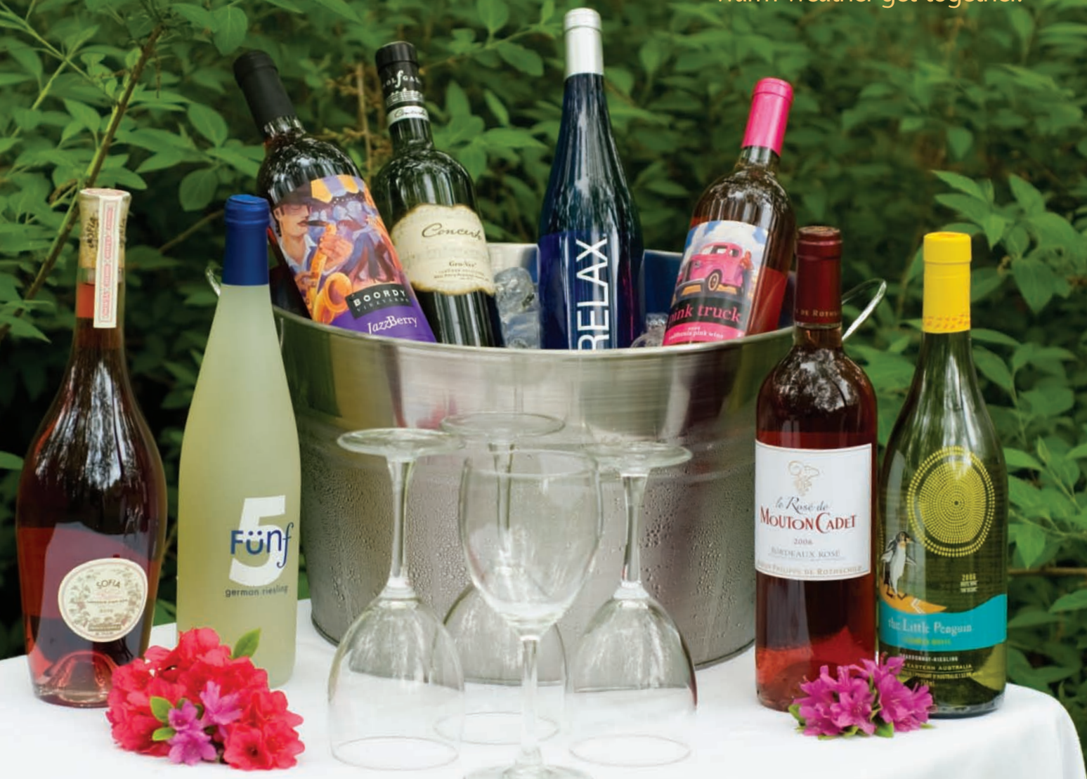
From left to right: Sofia Rosé, Careros Pinot Noir 2006: Produced by Francis Coppola's California winery, Sofia Rosé has a fragrance of fresh strawberries and rose petals with juicy black cherry and raspberry flavors reminiscent of rosés served in the South of France. Fünf German Riesling 2006: Fünf, translated in German, means "five," which is what time the fun always starts. Light, fruity and well-balanced with a fresh, clean finish, Fünf complements a wide range of cuisines. Boordt Vineyards JazzBerry: The juices of raspberry and strawberry make beautiful music together in this luscious, sweet wine, which adds perfect harmony to your picnic, dessert, or casual party. Concerto by Wolfgang, Gru-Vee, Austria 2005: Made from sweet, vine-ripened, hand-selected Grüner Veltliner grapes, Concerto has a delicate and exquisite composition, and is outstanding served with red meats, seafood, and Asian dishes. Relax German Riesling 2006: Slightly dry with a fruity bouquet, intense flavors of apples and peaches, and a hint of citrus, this refreshingly crisp Riesling is a perfect party wine that can be enjoyed with everything from seafood and poultry to Asian foods and salads. Pink Truck, California Pink 2006: Blended with a touch of Grenache and Mourvedre for richness and finesse, this sophisticated white zinfandel has bright berry and citrus aromas, fresh raspberry and orange flavors, and a bright, lush finish. Le Rosé de Mouton Cadet, Bordeaux Rosé 2006: Vinified using the traditional "saignée" method, this rosé should be served young at a temperature of 46 degrees Fahrenheit to enhance its subtle and refreshing fruit flavor, sustained in a full finish. The Little Penguin Summer White, Chardonnay-Riesling, South Eastern Australia 2006: The limited-edition summer blend of chardonnay and Riesling has aromas of fresh, tropical fruits with hints of lemon and lime. Subtle notes of minerals add complexity leading to a juicy, clean finish.

Life doesn't get much better than a glass of wine on a summer day—unless you're sharing it with friends! These unique varietals and refreshing blends are ideal for any warm-weather get-together.